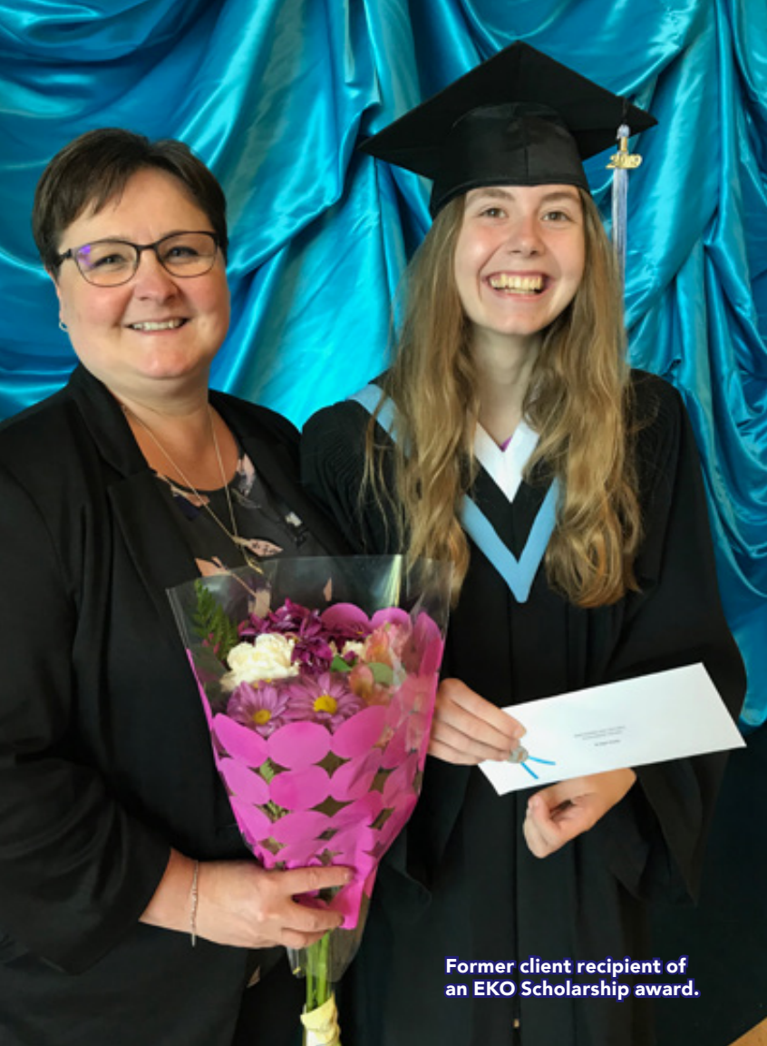
Former client recipient of an EKO Scholarship award.