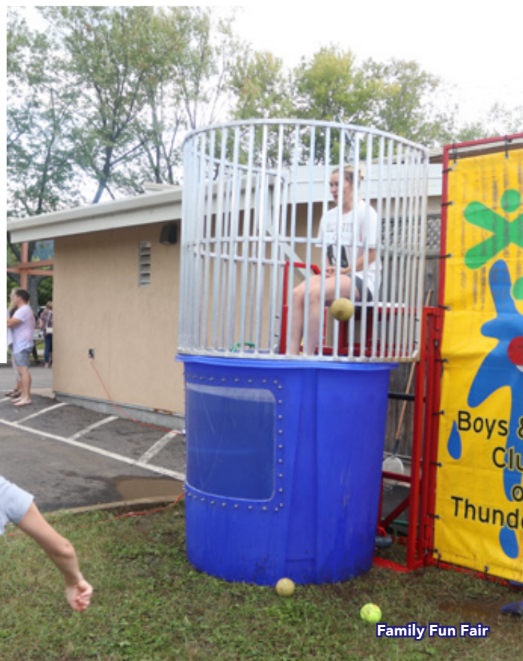
Family Fun Fair