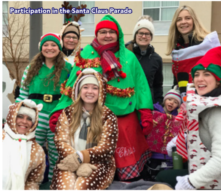
Participation in the Santa Claus Parade