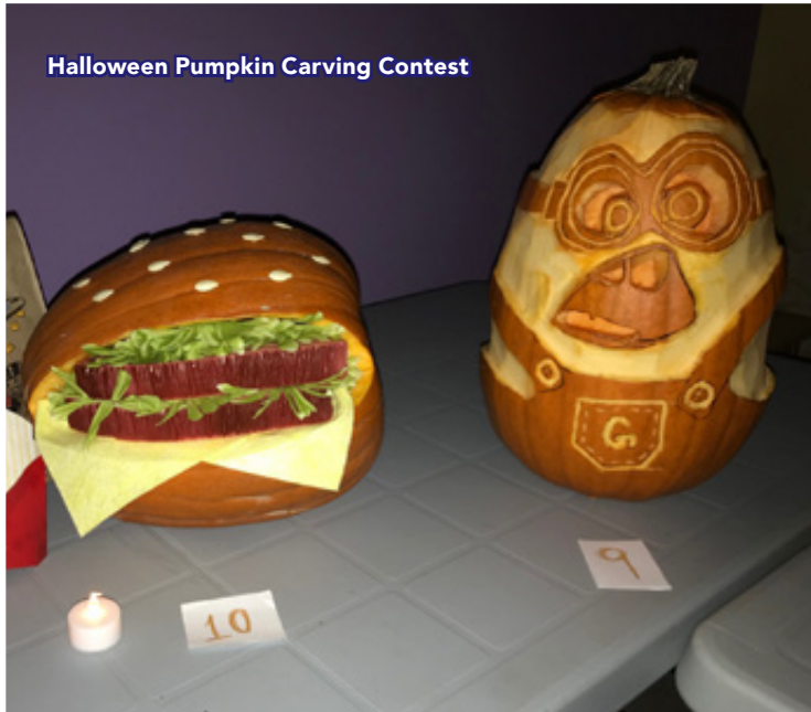
Halloween Pumpkin Carving Contest