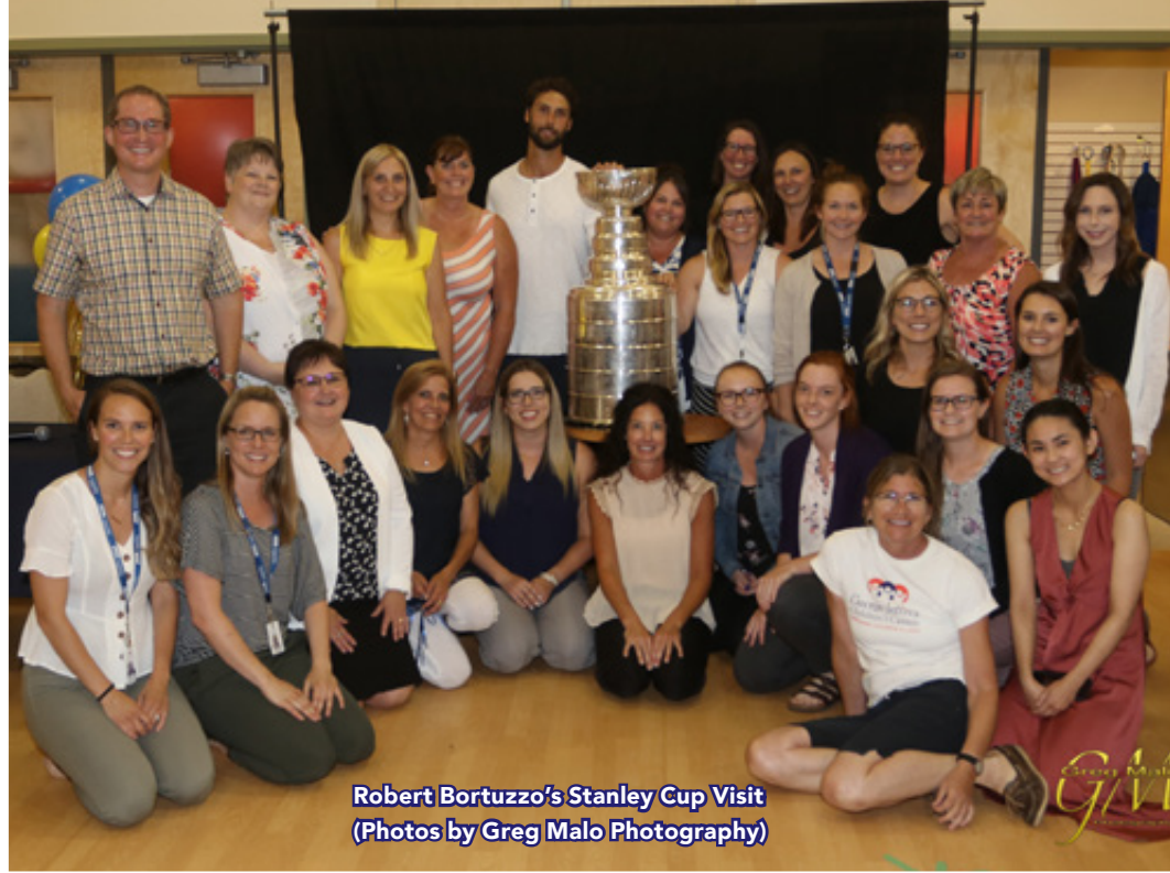
Robert Bortuzzo's Stanley Cup Visit